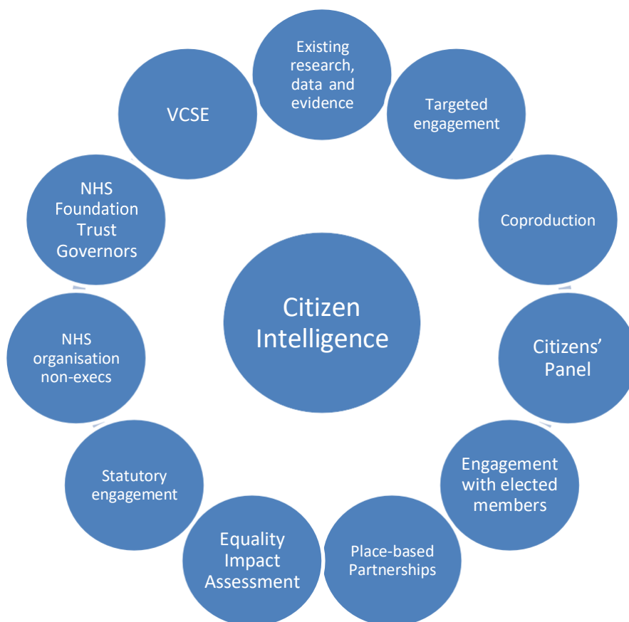
Figure 2. Framework for generating citizen intelligence