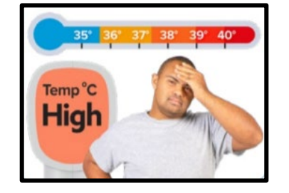
A high temperature